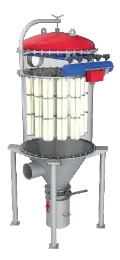
INFA-MINI-JET, AJM dust collector with hopper and dust collection bin