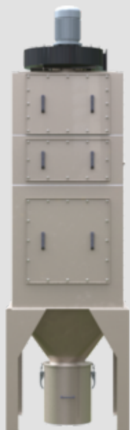
Cartridge filter INFA-JETRON IPF

Cartridge filter for continuous de-dusting of machines and work places, designed as venting filter or top filter, as de-dusting unit with hopper and dust discharge bin.